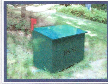
3' (h) x 2'(d) x 3'9" (w) as shown

100 BENEDICT STREET PITTSTON PA 18640 PHONE: 570-883-0775 FAX: 570-883-2232 EMAIL: gtfab@comcast.net