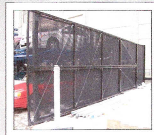
Fabricated and Powder Coated for Giant Industrial Installations